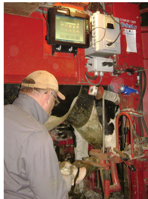
WCCHTA trimmers utilize computerized lesion recording systems such as Hoof Supervisor®, shown at the top of this photo.